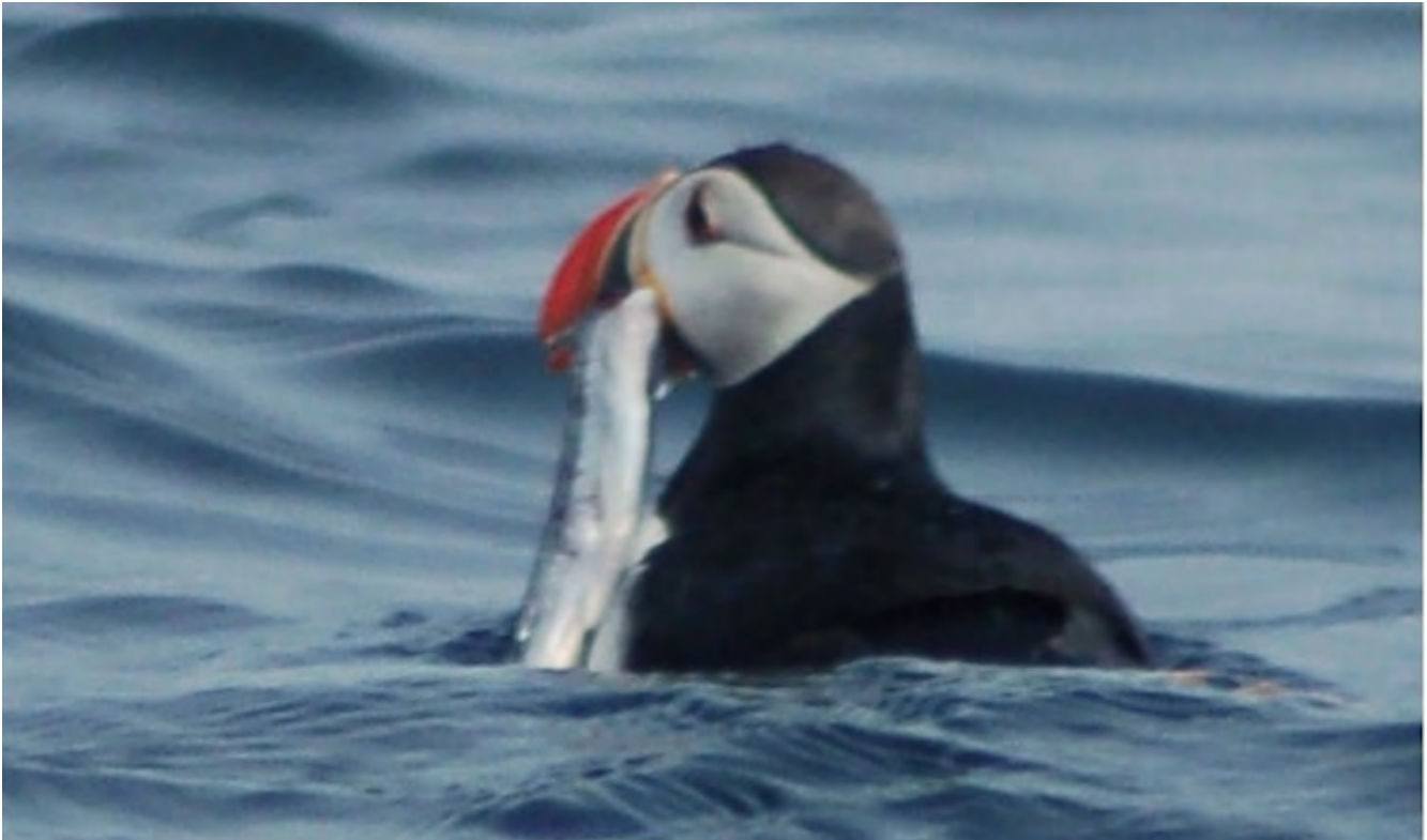
Photo: An Atlantic Puffin with a capelin in the sea off Bay Bulls, Newfoundland.

REYKJAVIK (IDN) - After five research expeditions in search of capelin, Iceland's Marine and Freshwater Research Institute (IMFRI) has decided not to recommend a quota for it this year, arguing that global warming is probably responsible for the lack of the fish.