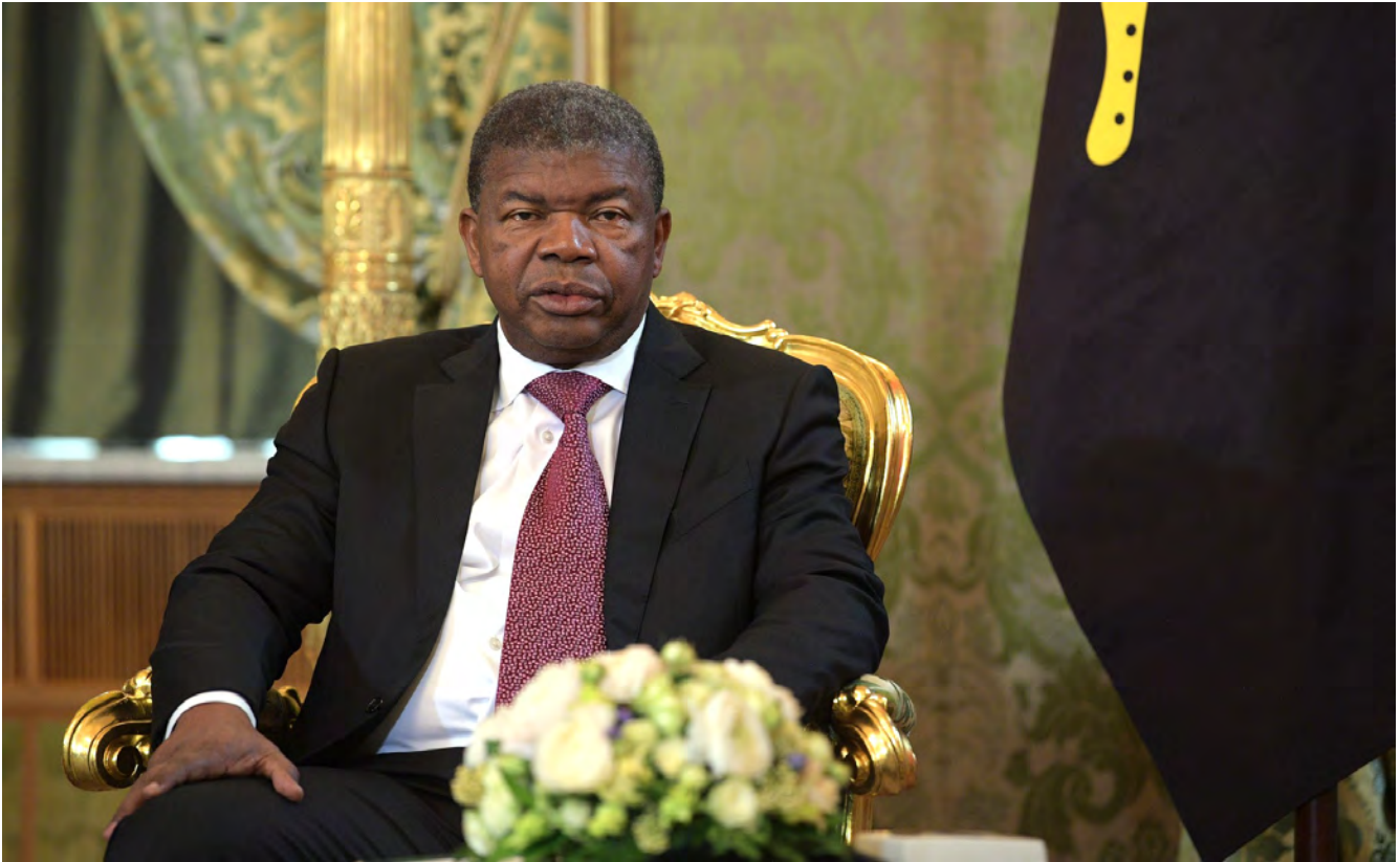
Photo: President of Angola Joao Lourenco.

MOSCOW (IDN) – Many African countries are looking for profitable business, investment and trade rather than development aid. Now Angola, a south-central Africa, has announced corporate plans to diversify its state business away from purchasing to full-fledged manufacturing of Russian military equipment for the southern African market, and possibly other regions in Africa – impeding realization of the Sustainable Development Goal 16 calling for peace and justice.