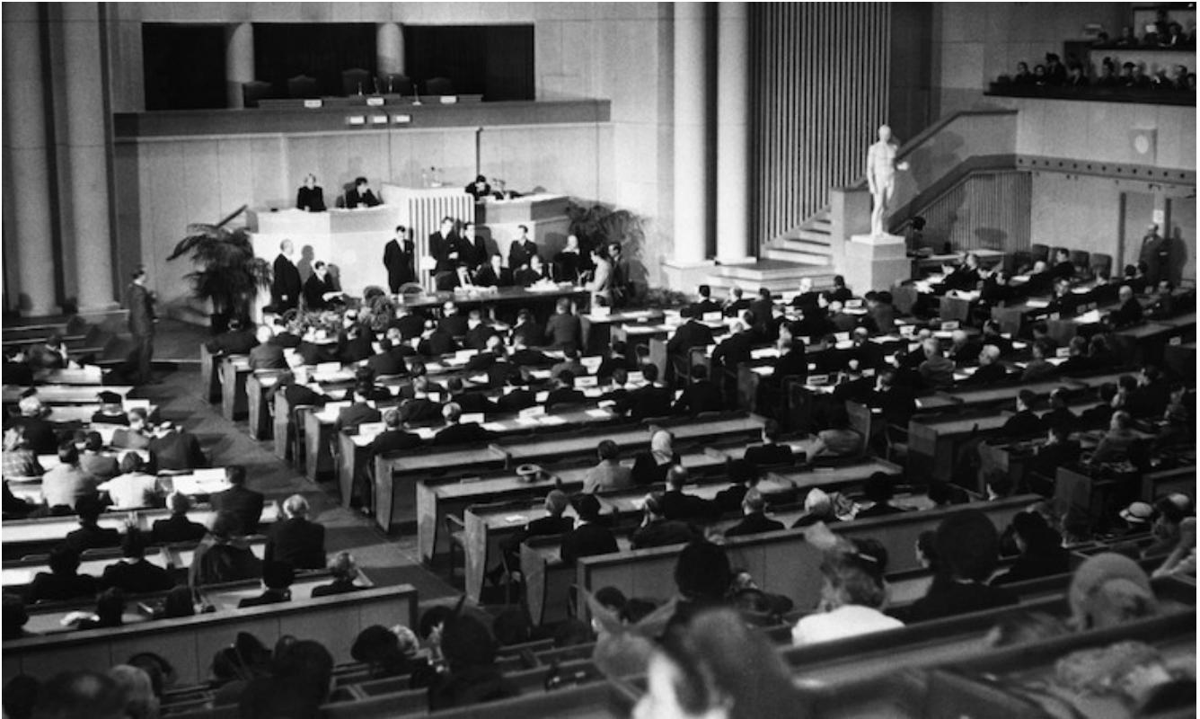
Image: Geneva Conventions of August 12, 1949 and the Protocol Additional adopted in 1977.