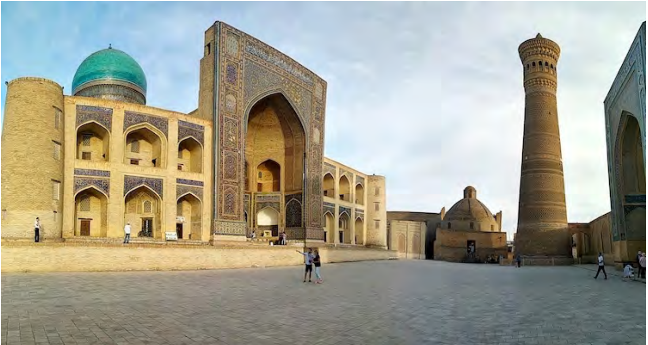
Photo: The Kalyan minaret is one of the most prominent landmarks in the city of Bukhara. The minaret was built by the Qarakhanid ruler Mohammad Arslan Khan in 1127 to summon Muslims to prayer five times a day.

BUKHARA, Uzbekistan (IDN) – The city of Bukhara was a major trading hub of the ancient Silk Routes that connected Asia to the Arab world and Europe. With the Uzbekistan government’s lifting of restrictions on foreign tourists in 2016 and global interests on the ancient Silk Routes gathering momentum, this 2000-year-old city is poised to become a major tourist hub of Central Asia. (Read more on page 78)