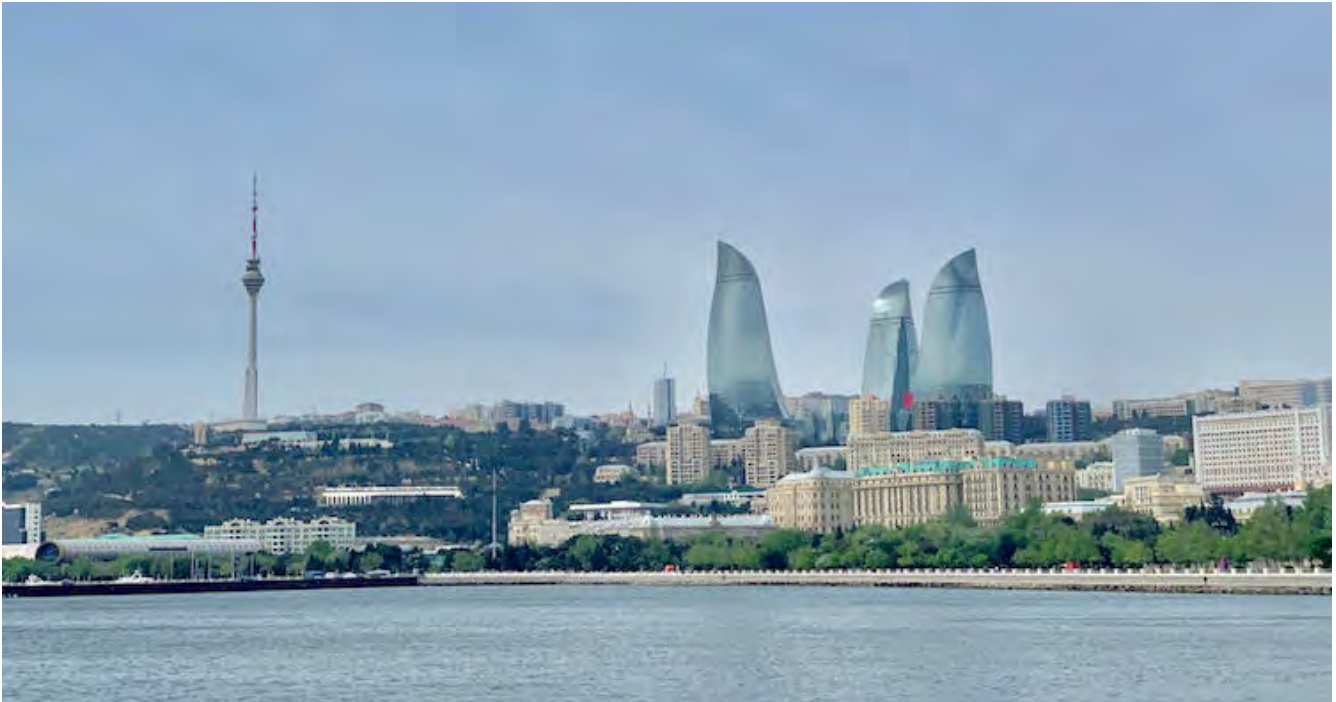
Photo: A view of Baku, Azerbaijan. Credit: Katsuhiro Asagiri | IDN-INPS

NEW YORK (IDN) – Following a recent series of hate-fuelled attacks on places of worship around the world, a forum on intercultural dialogue was told May 2 that “in all these heinous and cowardly attacks... we see a common pattern: hatred of the ‘other’. These criminals are hijacking entire faith communities, pitting religions against each other.”