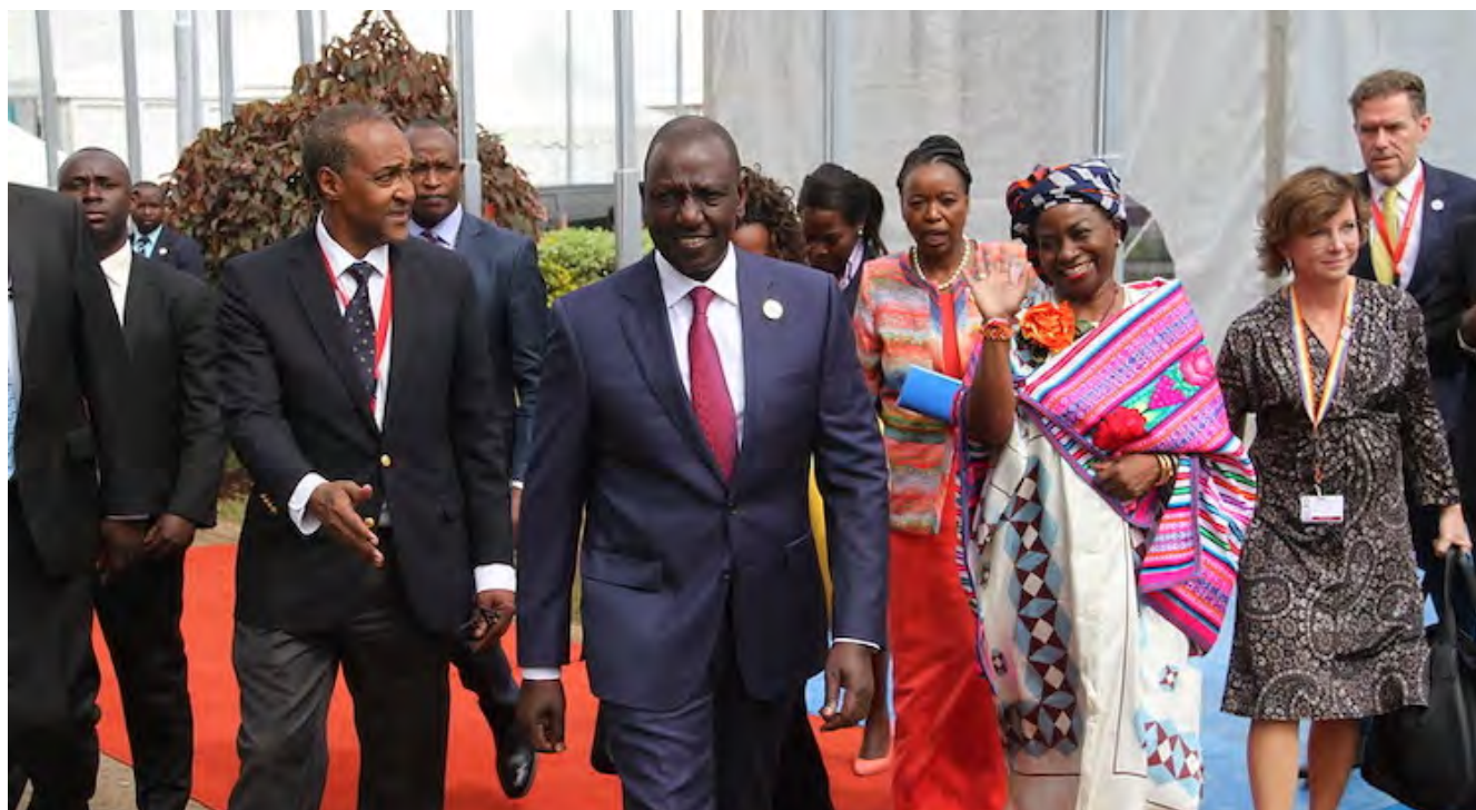
Photo: Nairobi ICPD25 Nairobi Summit closes with call to action.

NAIRBI (IDN) – ICPD25, held in the Kenyan capital Nairobi from November 12-14 and marking the 25th anniversary of the 1994 International Conference on Population and Development (ICPD) in Cairo, Egypt, ended with bold commitments towards attainment of the rights of women and girls.