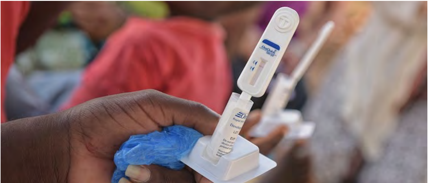
Photo: Showing a HIV self-test.