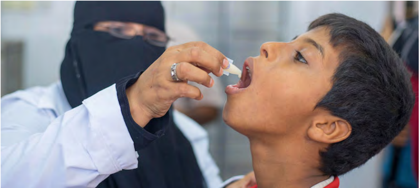
Photo: A health worker administers a vaccination against cholera to a young boy in Yemen.

GENEVA (IDN) – A list of urgent, global health challenges released by the World Health Organisation (WHO) at the beginning of 2020 reflects deep concern that leaders are failing to invest sufficient resources in core health priorities and systems. This, says the Geneva-based UN agency, is putting lives, livelihoods and economies in jeopardy.