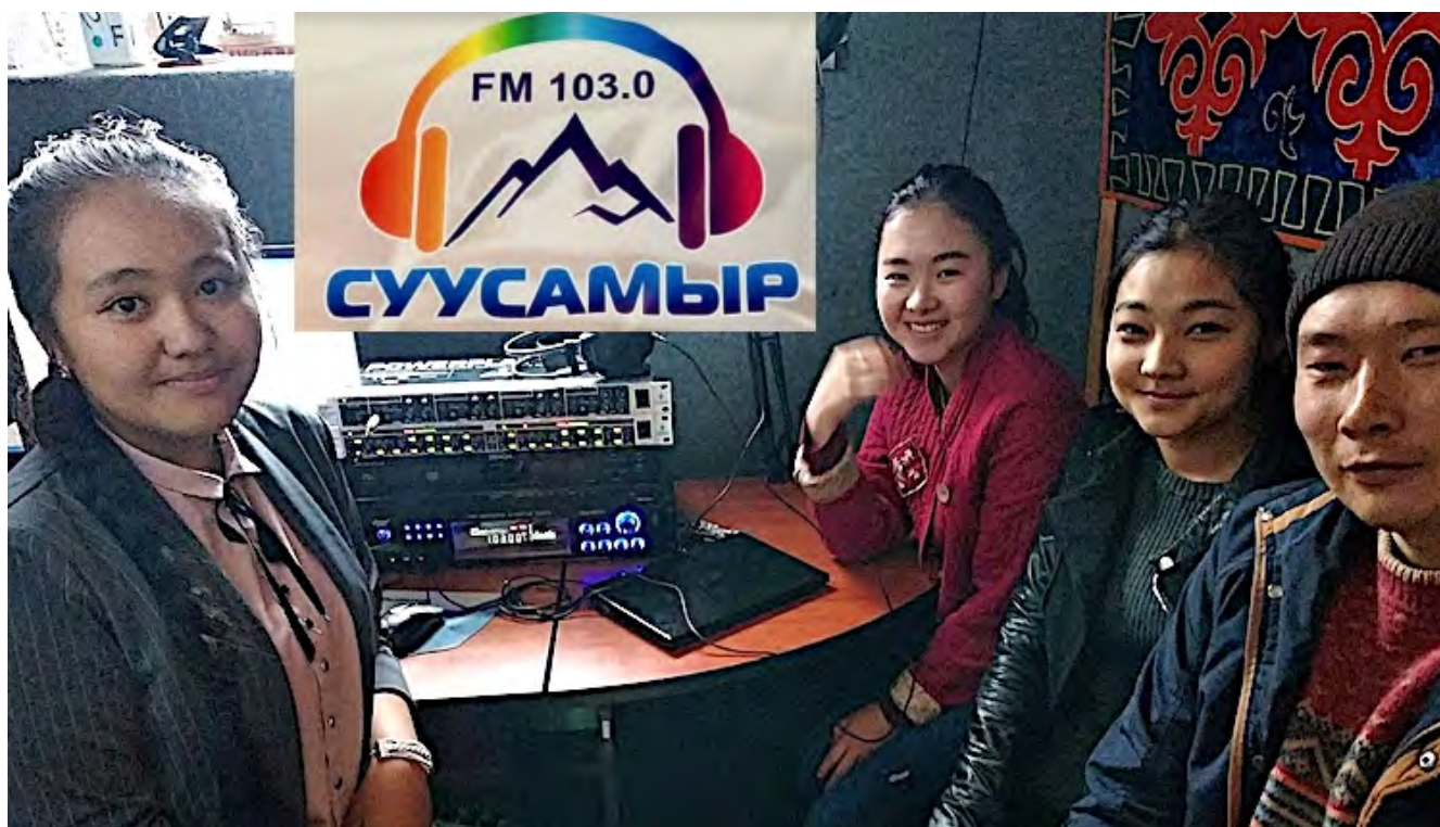
Photo collage by the writer with logo of Suusamyir FM 103 and a picture of the community radio volunteers.

SUUSAMYR, Kyrgyzstan (IDN) – Travelling on the new Silk Roads recently upgraded by the Chinese, one drives up through stunning mountains that are still covered by snow even as summer approaches. The road from Kyrgyzstan’s capital Bishkek climbs up to a peak of about 4,000 meters before descending over 1,500 meters to a picturesque valley to reach one of the remotest communities in the country, the village of Suusamyir home to about 1,300 traditionally nomadic people.