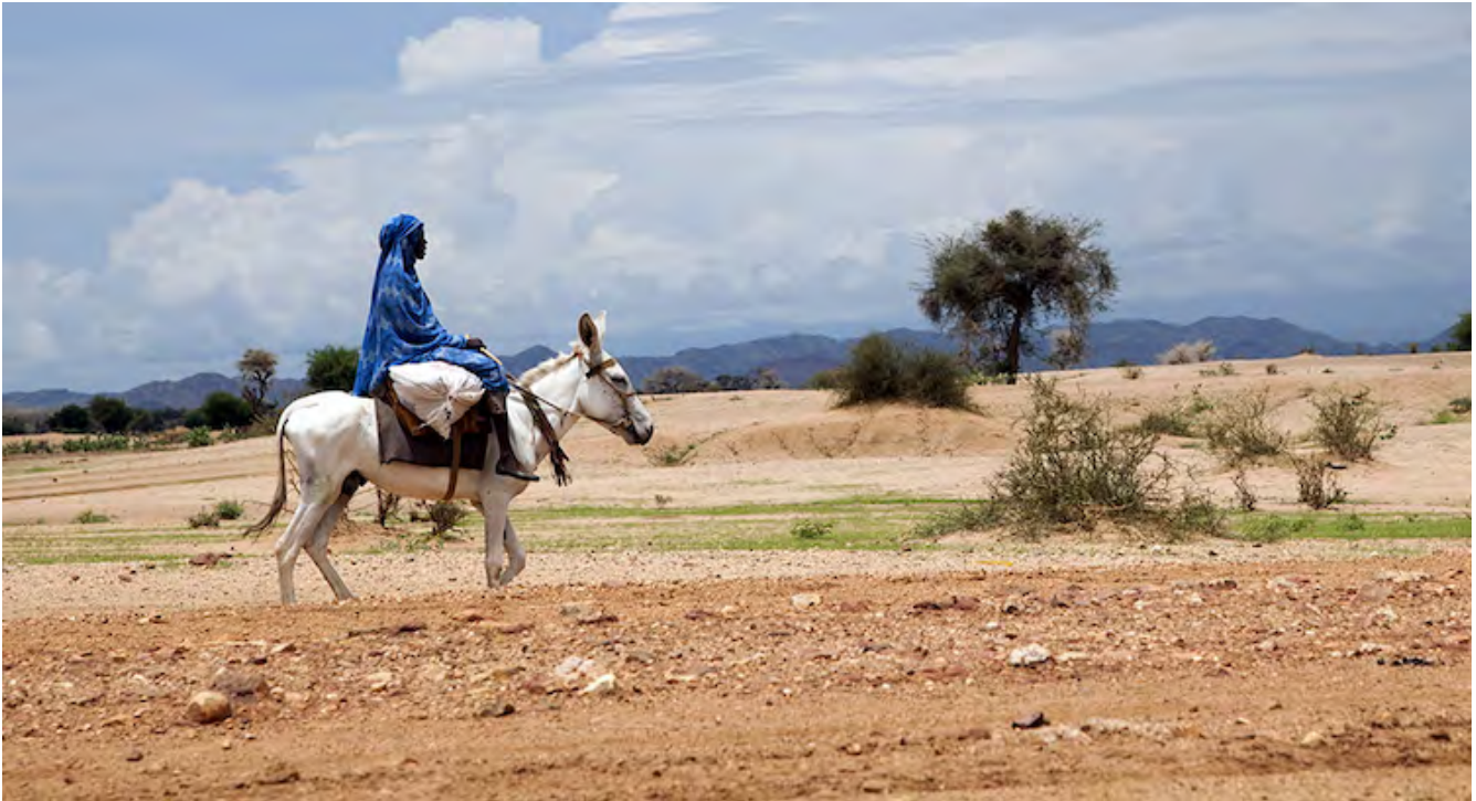
Photo: A woman dressed in blue rides a white donkey through open vast terrain surrounded by mountains.

NEW YORK (IDN) – Since the first International Day of Rural Women was observed on October 15, 2008, there is agreement that rural women and girls, including indigenous women, play a critical role in enhancing agricultural and rural development, improving food security and eradicating rural poverty.