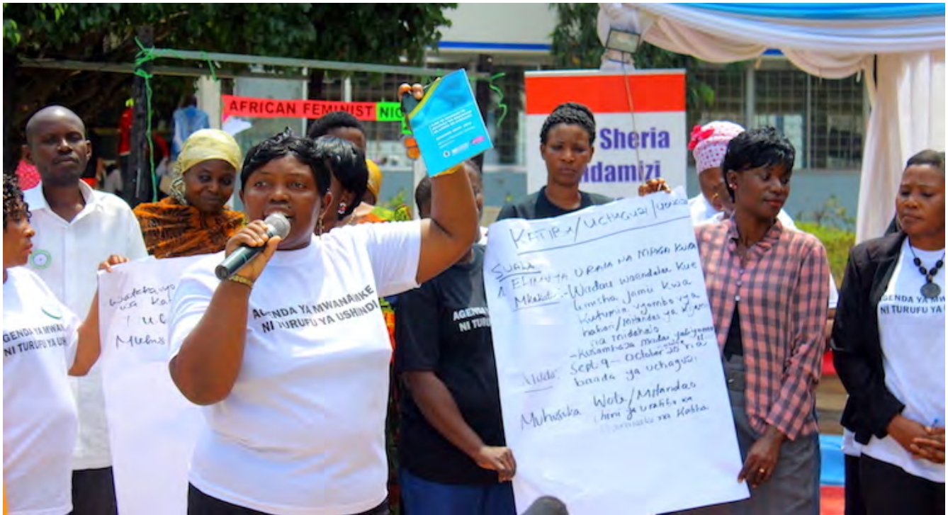
Photo: Women taking part in a demonstration to oppose sextortion in Dar es Salaam in 2018.

DAR ES SALAAM (IDN) – A poster bearing a message “Graduate with A’s not with AIDS” at the University of Dar es Salaam, tells a grim story of female students who offer sex to obtain higher grades.