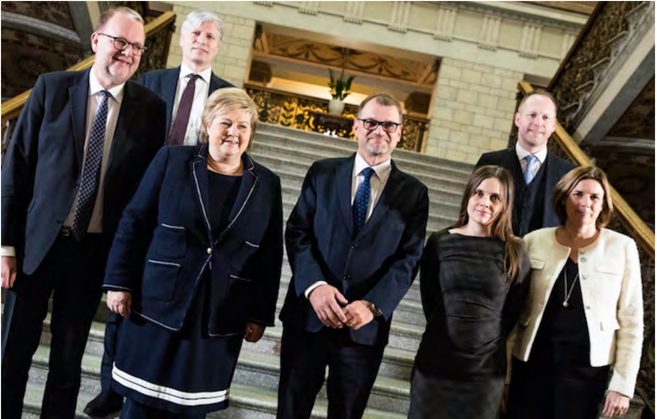
Photo: Gathered at the climate summit in Helsinki, from back left: Norway's Environment Minister; Denmark's Energy Minister; Norway's Prime Minister; Finland's Prime Minister; Iceland's Prime Minister; Sweden's Minister for International Development Cooperation and Climate, and Deputy Prime Minister; and Iceland's Environment Minister

REYKJAVIK (IDN) – On September 5, 2017 – two years after the United Nations adopted Agenda 2030 with its 17 Sustainable Development Goals (SDGs) and 169 targets – the Nordic countries jointly launched the Generation 2030 programme with the aim of speeding up implementation of Agenda 2030 through official Nordic cooperation.