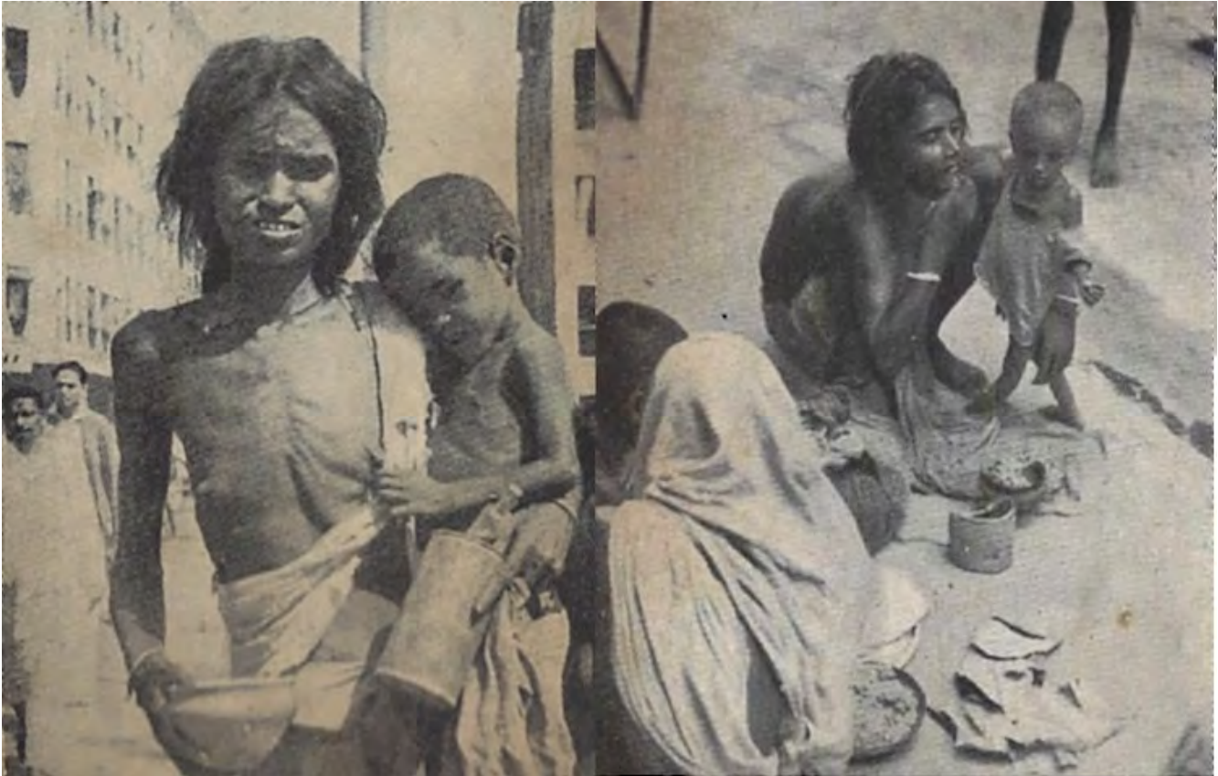
Photo: Mother in shreds of clothing with child begging on the streets of Calcutta during the Bengal famine of 1943 (left), and a family on the sidewalk in Calcutta during the Bengal famine of 1943 (right).