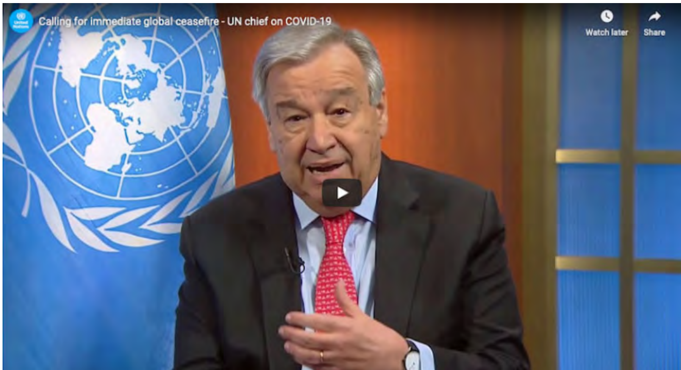
Photo: Screenshot of the UN chief calling for an immediate global ceasefire.

NEW YORK (IDN) – In a clarion call for "an immediate global ceasefire in all corners of the world", UN Secretary-General António Guterres on March 23 urged warring parties across the world to lay down their weapons in support of the bigger battle against COVID-19: the common enemy that is now threatening all of humankind.