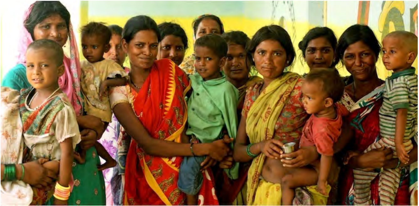
Photo: Portrait of Pardhi tribal community members, Maharashtra, India (7 June 2019).

NEW YORK (IDN) – Compared to 7.7 billion today, around 8.5 billion people are expected to inhabit the planet Earth within little more than a decade, and almost 10 billion by 2050, with only a few countries accounting for most of the increase, says a new United Nations report. The World Population Prospects 2019: Highlights , published by the Population Division of the UN Department of Economic and Social Affairs (UN DESA), provides a comprehensive overview of global demographic patterns and prospects. T