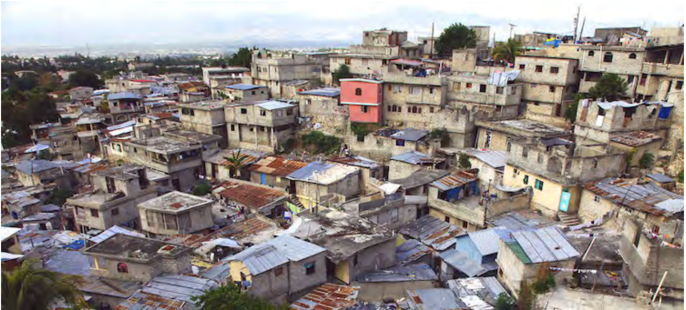
Photo: An informal settlement in Port-Au-Prince, Haiti.

NEW YORK (IDN) – Hundreds of thousands of Haitians lost their lives, including 102 UN personnel, and millions were gravely affected by the devastating earthquake that struck the Caribbean nation ten years ago on January 12.