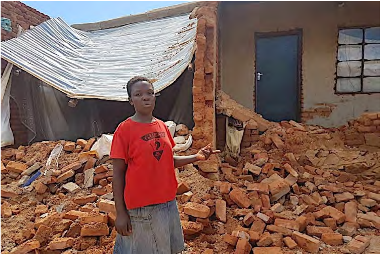
Photo: Cyclone Idai has impacted almost 3 million people across Mozambique, Zimbabwe and Malawi.

CHIMANIMANI, Zimbabwe (IDN) – The cyclone will affect the region for months to come after it impacted key livelihoods of fishing and agriculture in the largely rural region, the World Food Programme (WFP) said commenting the havoc caused by Cyclone Kenneth that struck Mozambique on April 25, nearly five weeks after the Cyclone Idai that lashed Southern Africa.