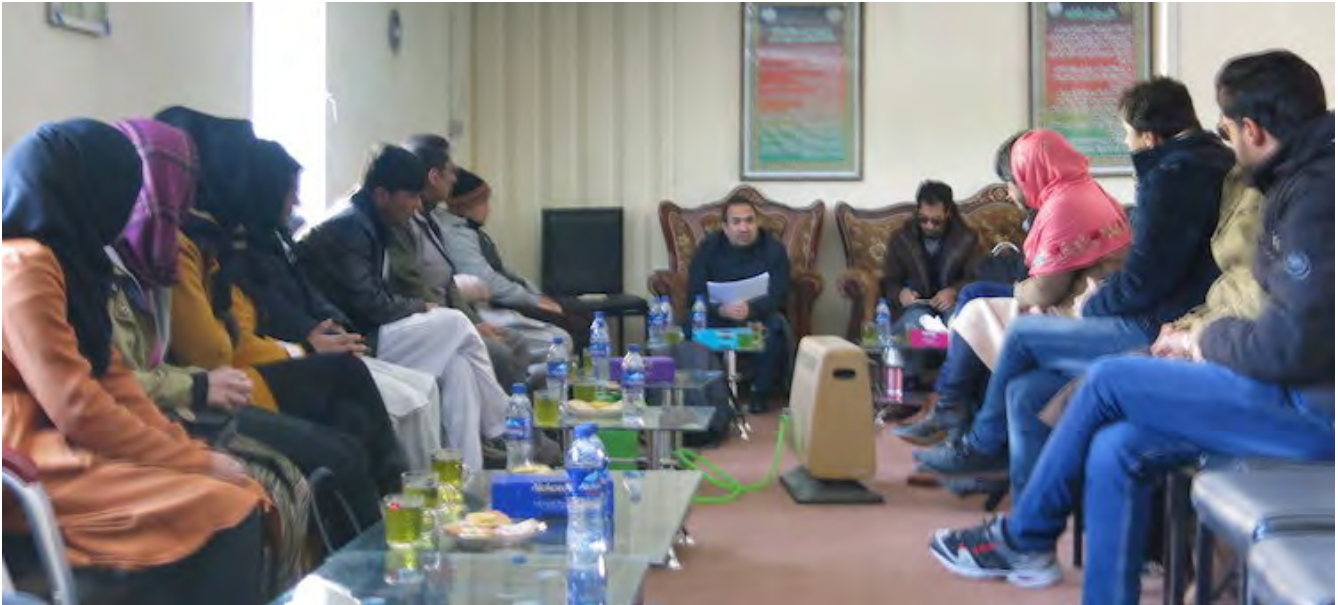
Photo: Community leaders in Afghanistan strategize human rights.

DOHA | KABUL (IDN) — Women, youth as well as community and religious leaders in Afghanistan have been craving for peace and earnestly preparing for it long before the United States signed a landmark agreement with the Taliban on February 29. The deal sets the stage to end America's longest war stretching over more than 18 years and allow President Donald Trump to begin the promised withdrawal of American troops. U.S. forces and their allies have been present in Afghanistan since 2001.