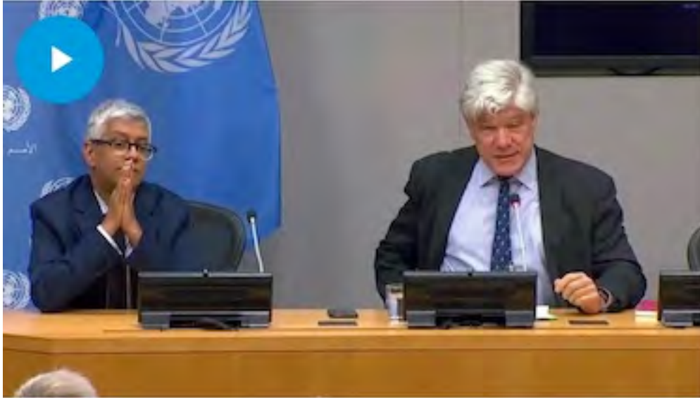
Photo in Text: Screenshot of Press Conference by Mr. Fabrizio Hochschild, Special Adviser on the Preparations for the Commemoration of the Seventy-Fifth Anniversary of the United Nations.

The information gathered – alongside the results of global opinion polling and media analysis – will feed into a global vision for 2045, the year the UN turns 100. “It is expected to increase understanding of threats to a sustainable, inclusive future for all, and drive collective action to achieve that vision,” UN News said.